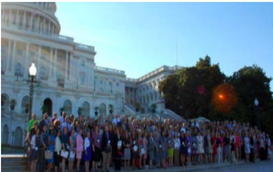
Legislative Summit Washington D.C.

It was an amazing professional experience. The Council for Exceptional Children (CEC) and the Council of Administrators of Special Education (CASE) did a thorough job preparing us for our Capitol Hill visits over the course of one and half days. We also had the pleasure of participating in a rally with Senator Cory Booker (NJ) supporting his sponsorship of a bill that will address our growing teacher shortage.